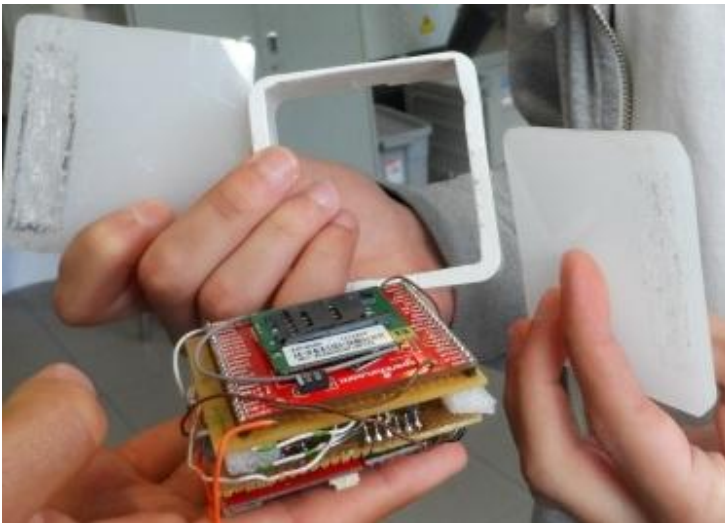
Figure 1. Prototype of the Pet Tracker I

The dimensions for the Pet Tracker prototype are following: 76 mm x 76 mm x 40 mm.